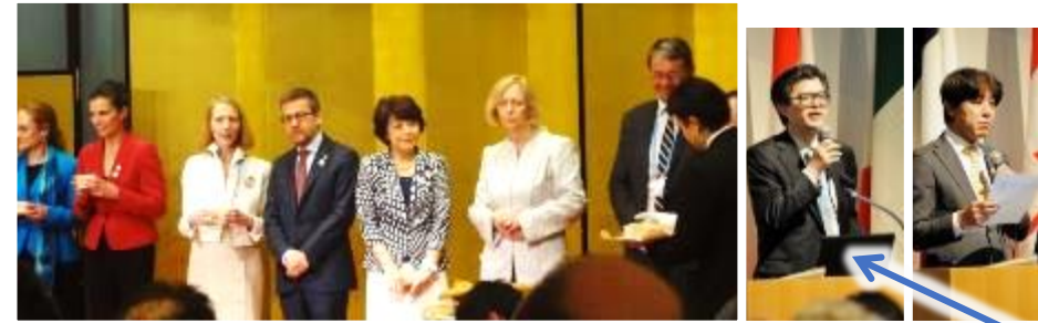
Photos by Cabinet Office of Japan, Ibaragi Prefectural Government, and Tsukuba City Government, 2016